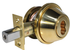
Single Cylinder (220), IC Shown in MB3 Finish, Shown with Anti-Pry Shield