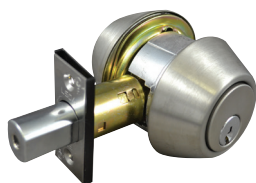
Double Cylinder (225) Shown in 32D Finish